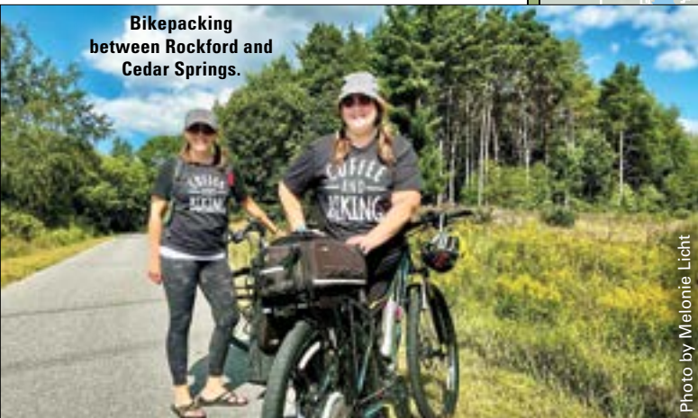
Bikepacking between Rockford and Cedar Springs.

The trailhead in downtown Comstock Park is a quarter-mile east of the US-131 exit. It's an excellent place to begin your journey with