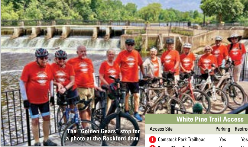
The "Golden Gears" stop for a photo at the Rockford dam.